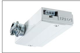
HU109 Splice Box